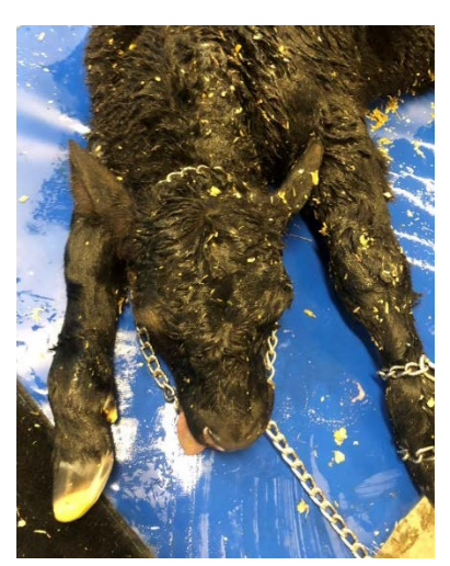
Figure 2: Chain placement around head and into mouth. Also referred to as a head snare or 'war bridle.